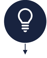
Keep the Lights On (Optimization)

Address today's challenges, and self-fund tomorrow's innovation